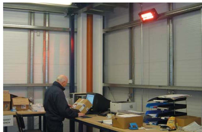
Work station, Warehouse